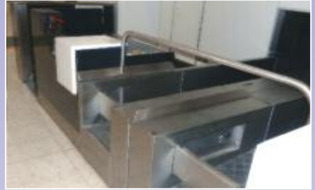
(110+) Check-in Desks Available Various Configurations Complete with Avery Scales and Baggage Belts