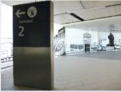
Signage, Seating and Advertising Boards