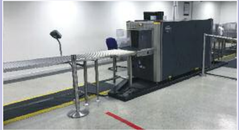
(12) Smiths Heimann Baggage Scanners, HI-SCAN 6040 aTiX and HI-SCAN 6046si