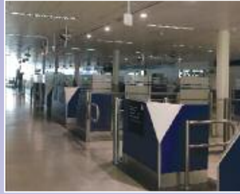
(15+) Kilometres of Stainless Steel Hand and Foot Modular Balustrade Systems