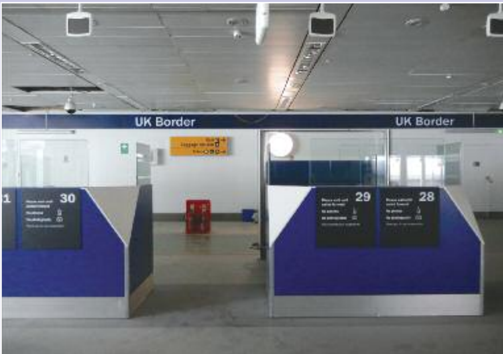
Passport Control Desks, Camera Systems and Queue Management