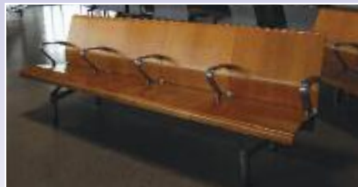
(4,000+) Airport Seats