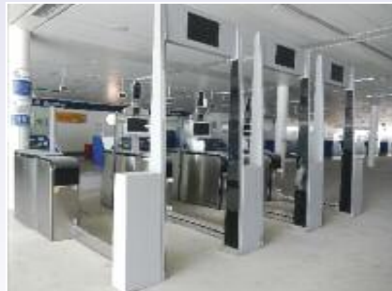
Iris Entry Scanners