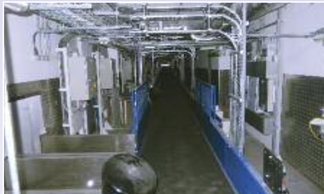
Complete Baggage Drop Systems