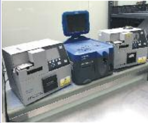
Smiths Barringer Ion Scanners