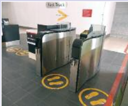
Fast Track Security Entry Gates and Desks