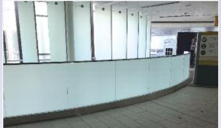
Kilometers of Removable Passenger Partition