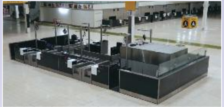
Modules of Check-in Desk