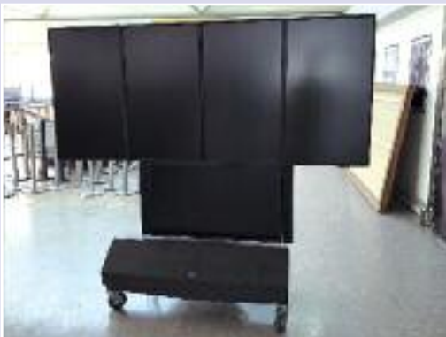
Portable Flight Information Display