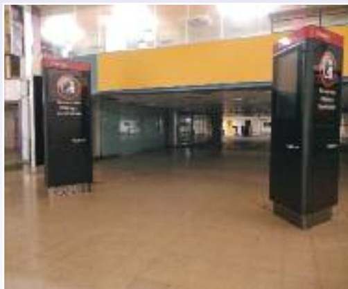
Security Information Signs With Built-in Display Screens