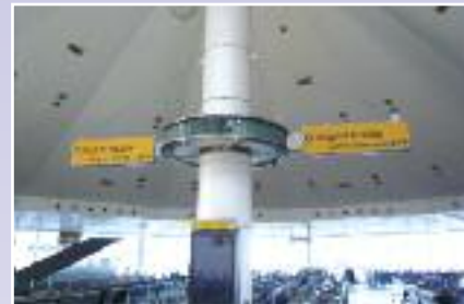
(100+) Display Systems