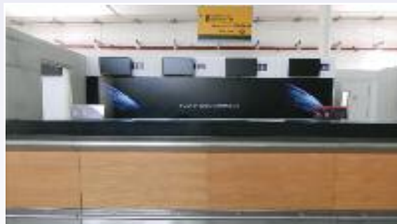
Flight Connection Desks