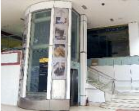
Two Storey Lift Passenger Elevator