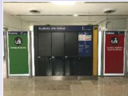
Airport Information Boards