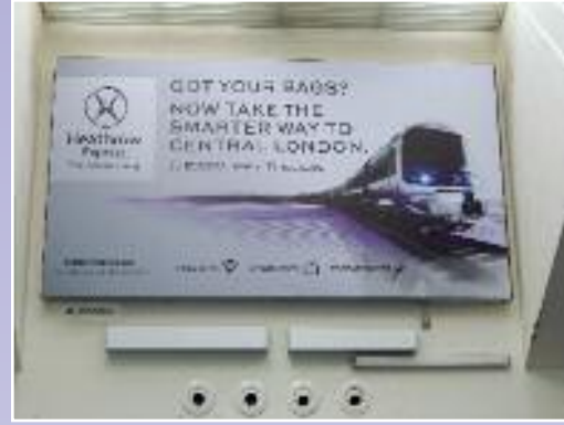
JCDecaux Advertising Systems