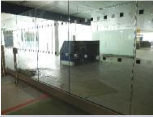
Blast Mitigation Glass Partitions