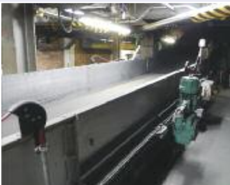
Fast Drop Baggage Systems