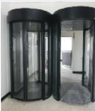
Air Lock Security Doors